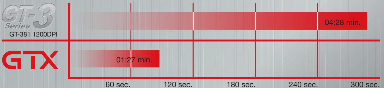
Image size approx. 32cm x 22cm cmymk only

Image size approx. 32cm x 22cm cmymk+w print